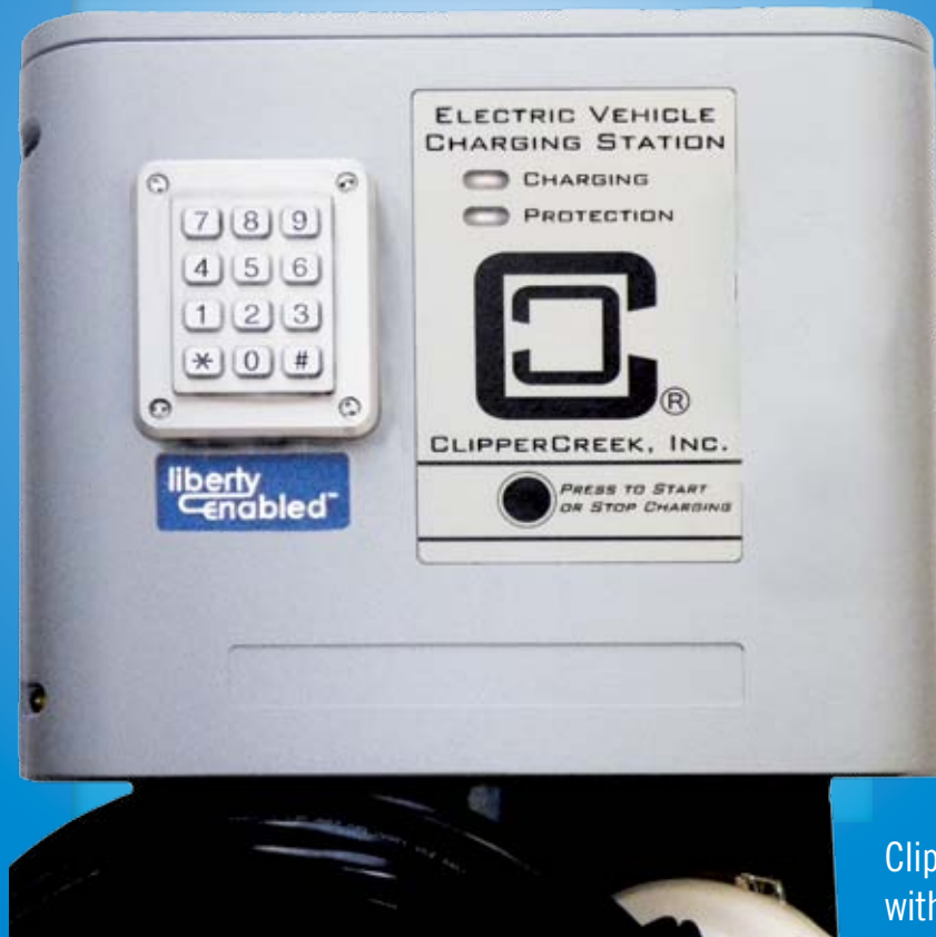
ClipperCreek's CS Series with Access Control

ClipperCreek offers the most innovative, cost-effective Access Control Solution in the industry.