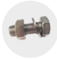
2 A Hex bolts 2 A Washers 2 A Nuts