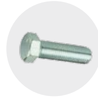
1 B Bolt