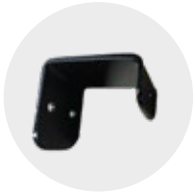
1 Retractor Bracket

Parts Included Please review the parts included to ensure you have all you need.